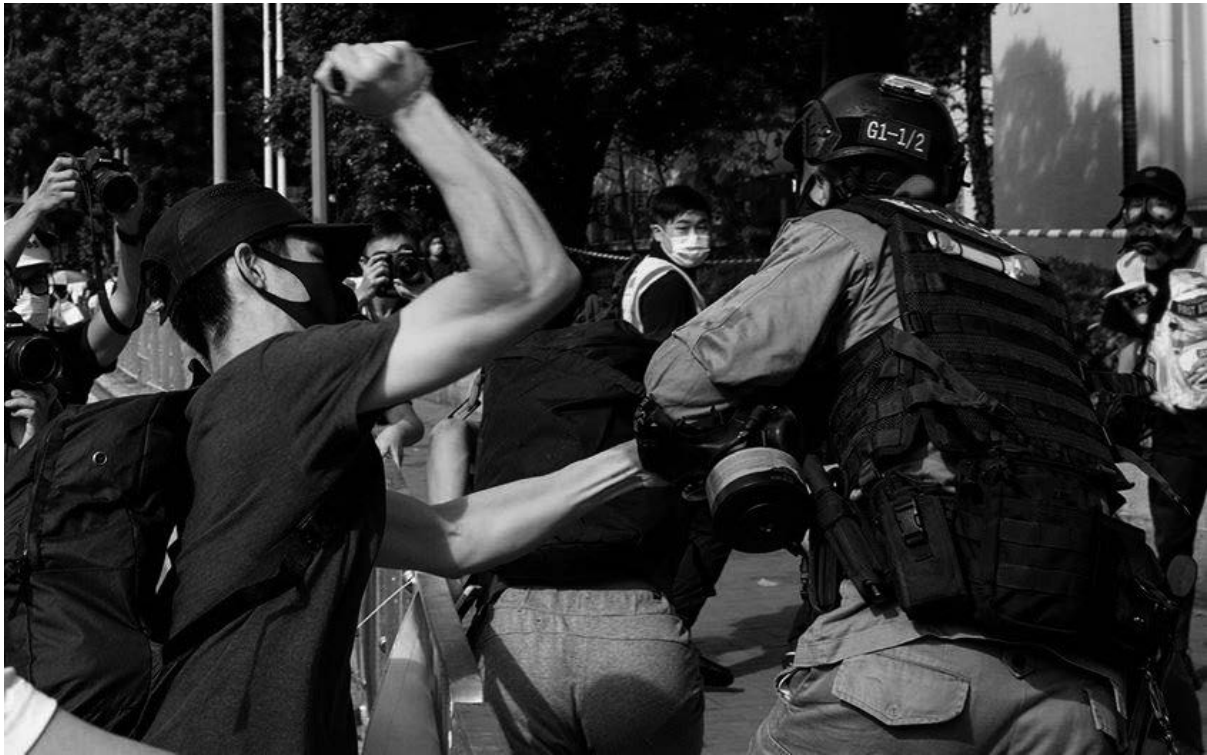
Early July PC was stabbed and assialant nicked on a Cathay plane heading to UK!!!