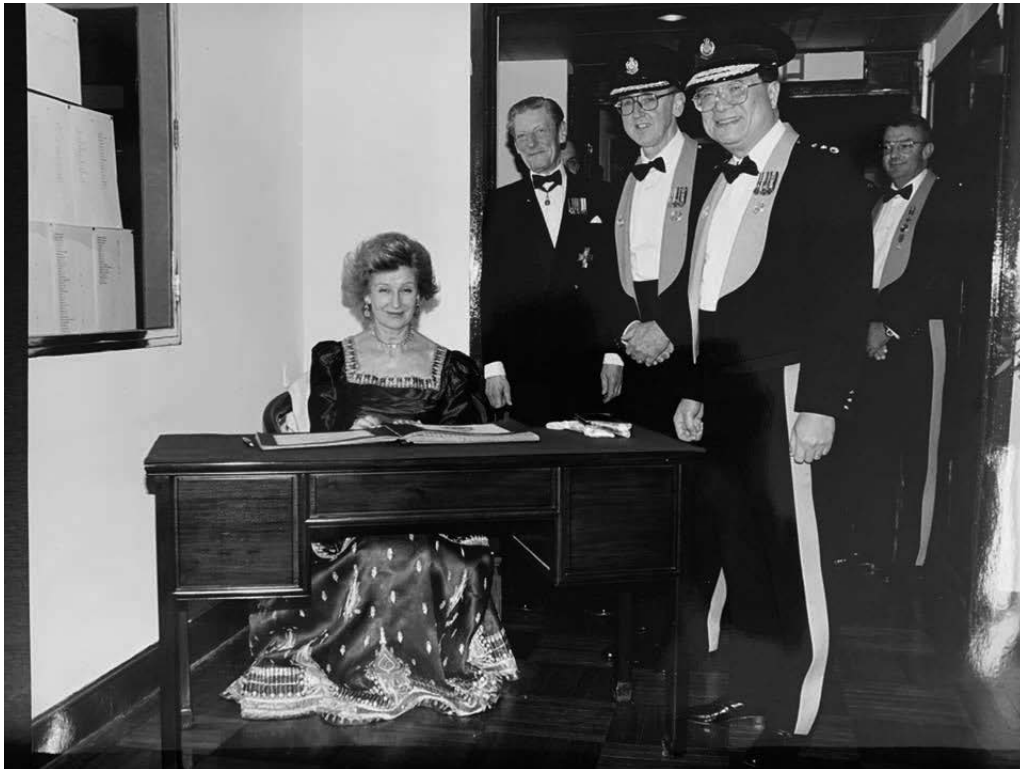
Farewell to HRH Princess Alexandria