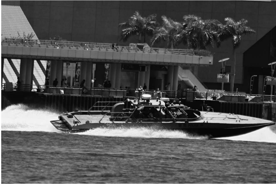
Marine Police on patrol or..... !!!!!